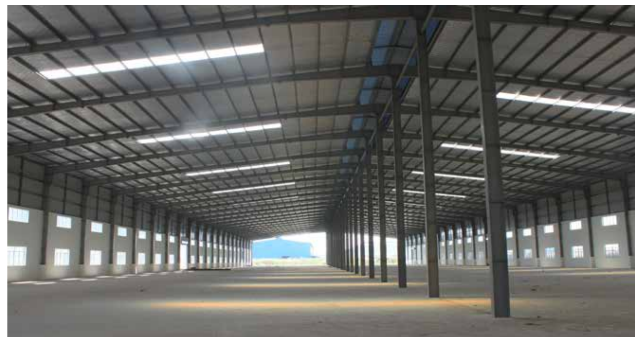
TAN UYEN – BINH DUONG PROVINCE