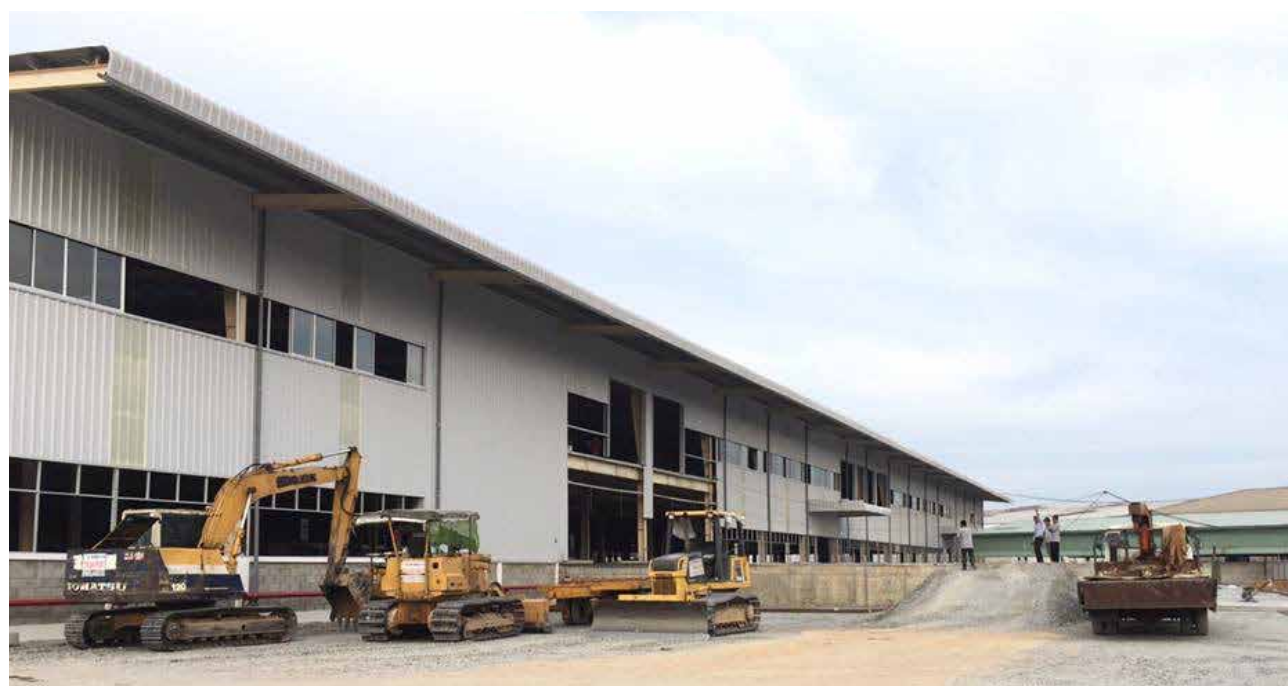
TAN UYEN – BINH DUONG PROVINCE SECOND PHASE