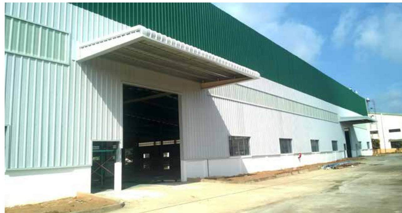
TAN UYEN – BINH DUONG PROVINCE