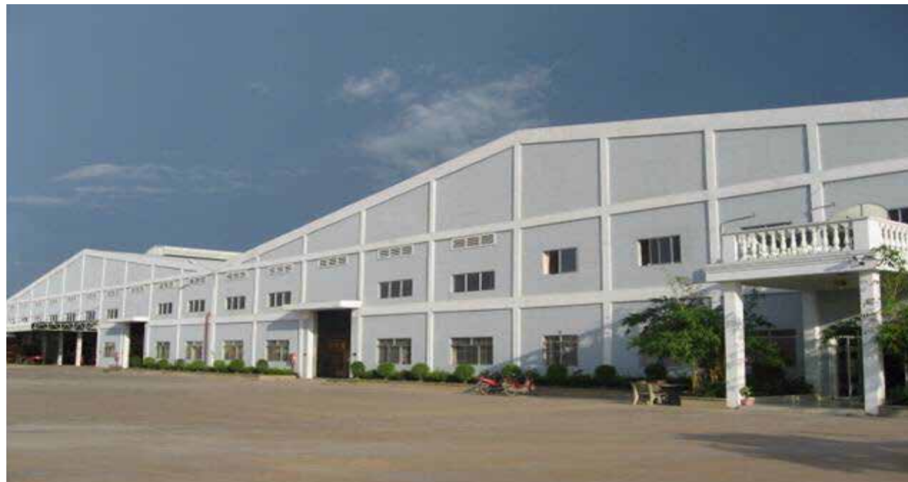
TAN UYEN – BINH DUONG PROVINCE