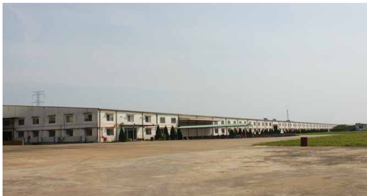
TAN UYEN – BINH DUONG PROVINCE