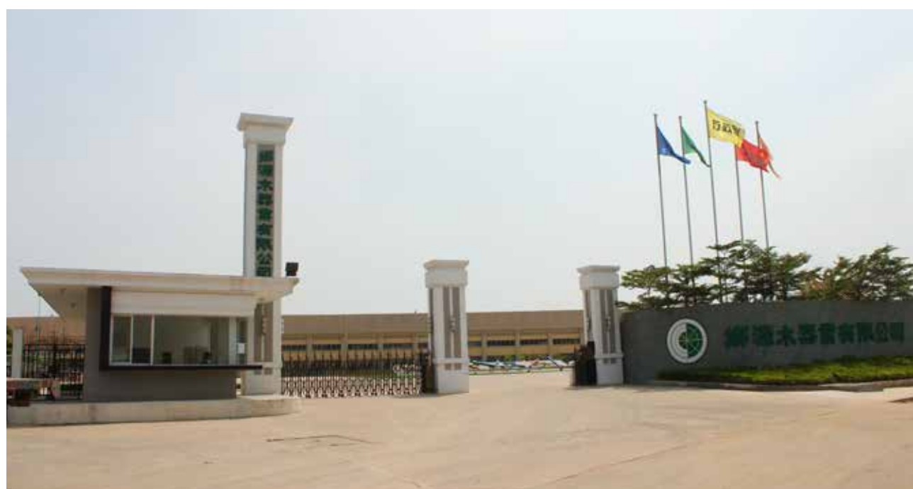
TAN UYEN – BINH DUONG PROVINCE