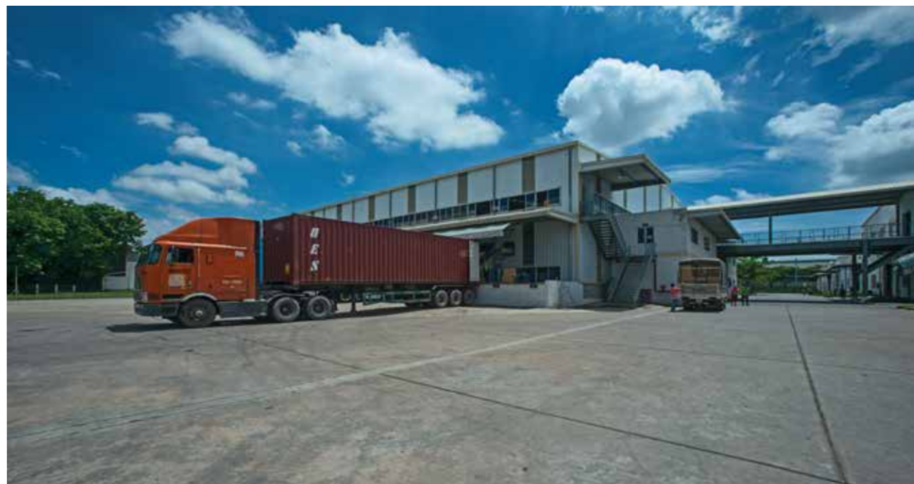
TAN UYEN – BINH DUONG PROVINCE