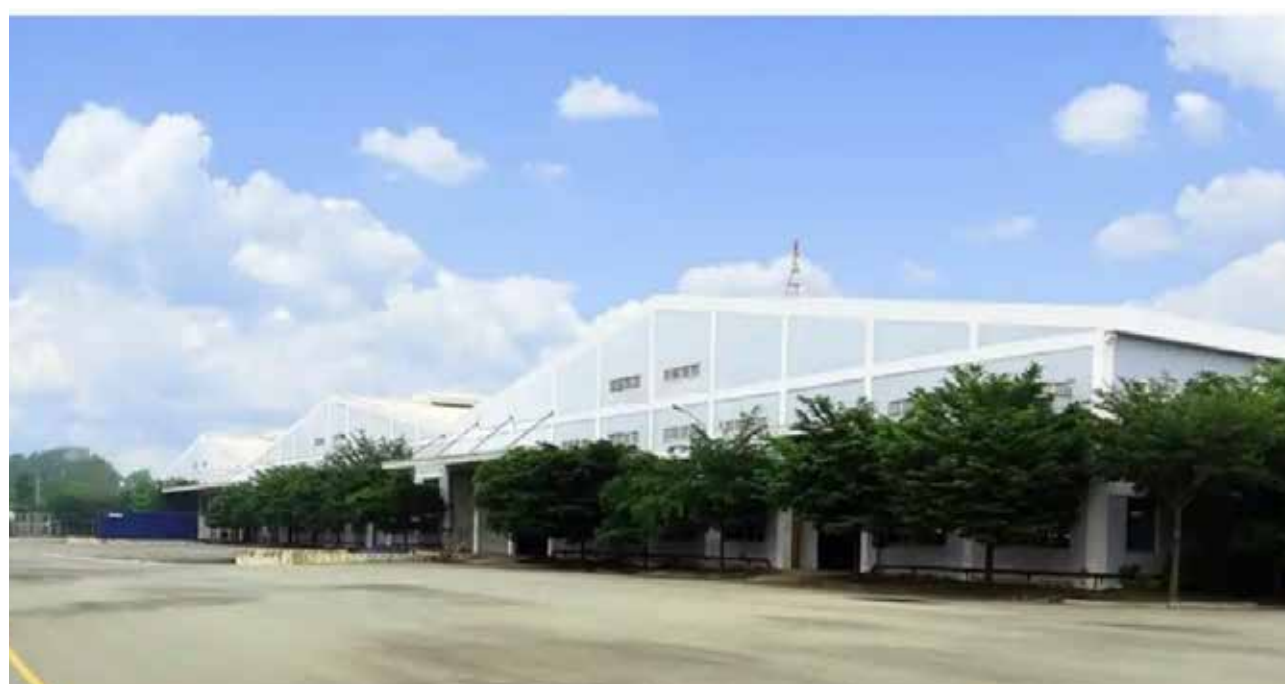
BEN CAT- BINH DUONG PROVINCE