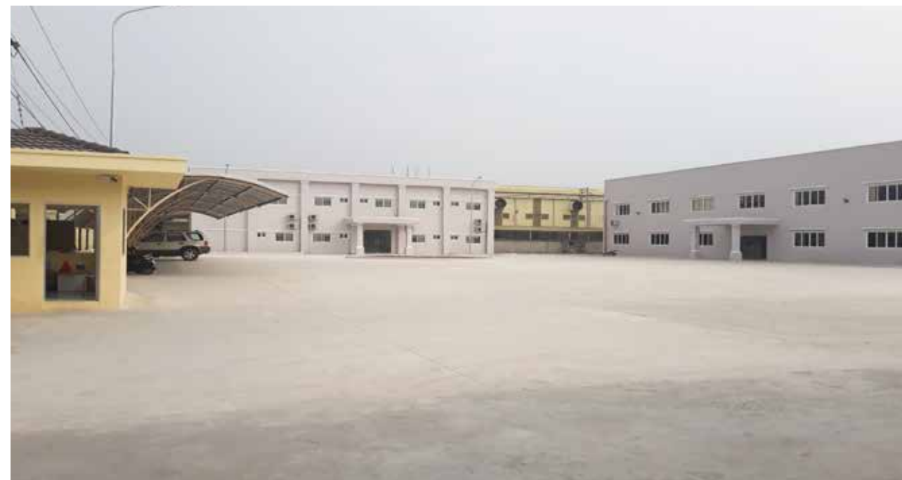
SONG THAN INDUSTRIAL AREA - BINH DUONG PROVINCE