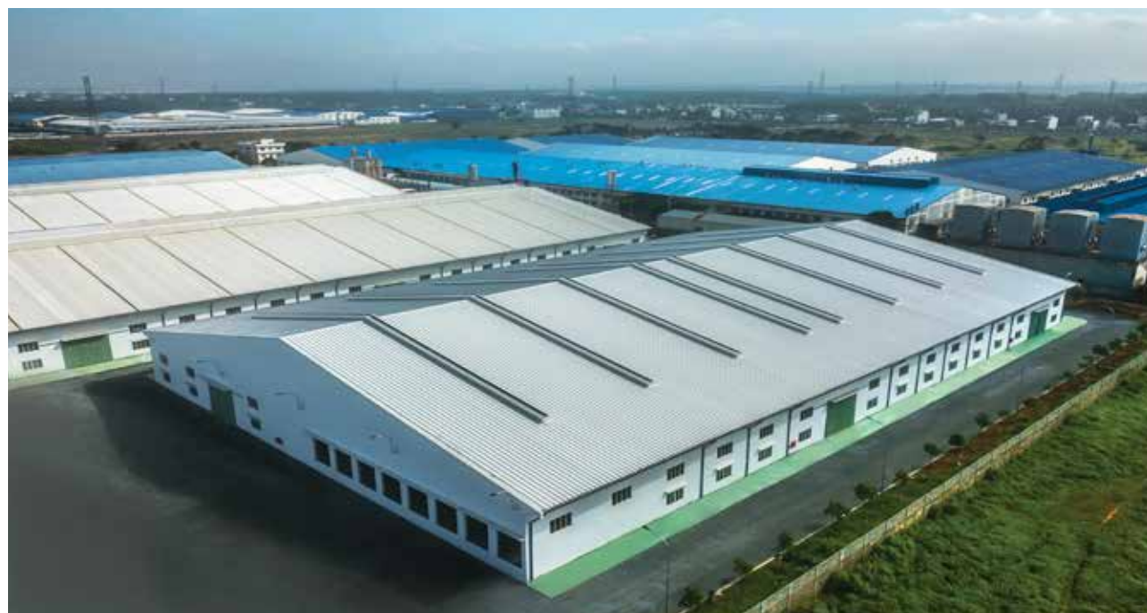
KIM HUY INDUSTRIAL AREA – BINH DUONG