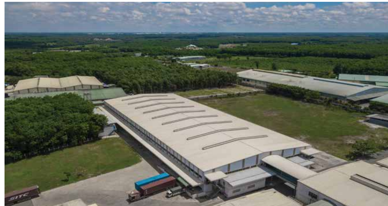
TAN UYEN – BINH DUONG PROVINCE