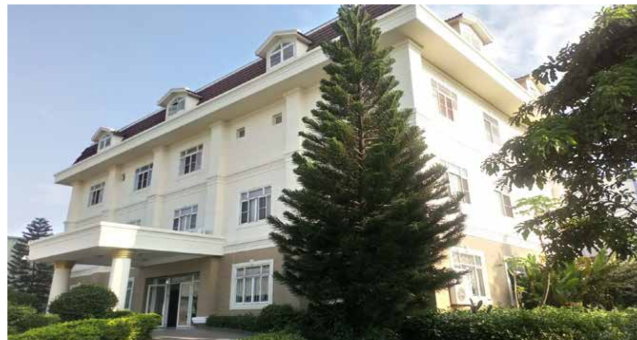
TAN UYEN – BINH DUONG PROVINCE