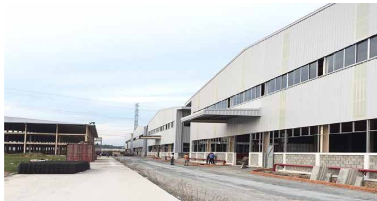
TAN UYEN – BINH DUONG PROVINCE SECOND PHASE

HIGH POINT FURNITURE GLOBAL CO.,LTD (CONTINUED)