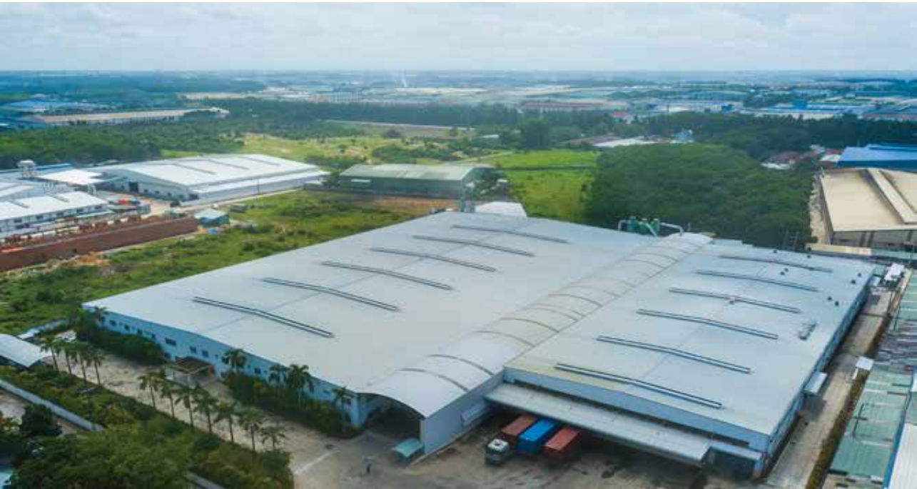
TAN UYEN – BINH DUONG PROVINCE