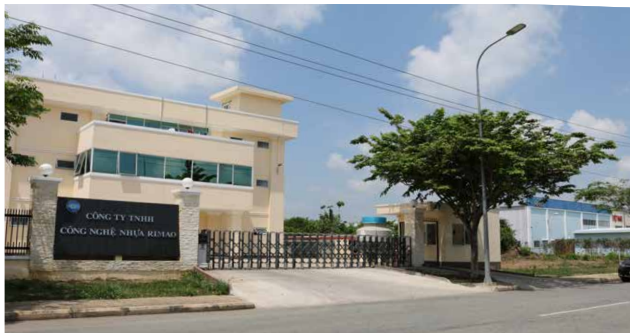
BEN CAT- BINH DUONG PROVINCE