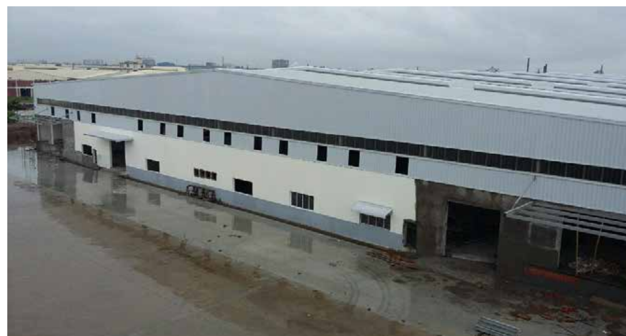
PHUC KHANH-THAI BINH CITY